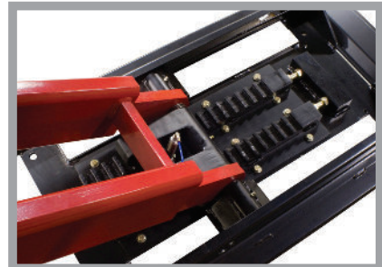
Open Runway Slots Under Rear Slip Plates