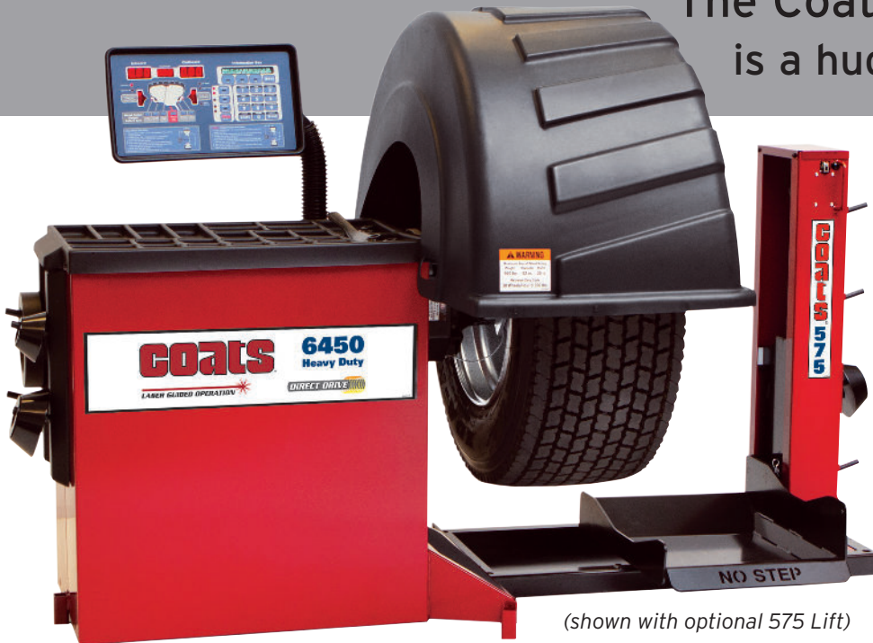
(shown with optional 575 Lift)

The Coats 6450 Series is a huge step forward.